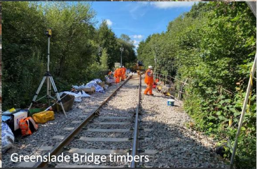
Greenslade Bridge timbers