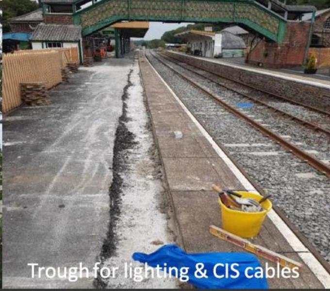
Trough for lighting & CIS cables